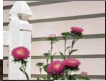
Double 4" select cedar clapboard in silver ash