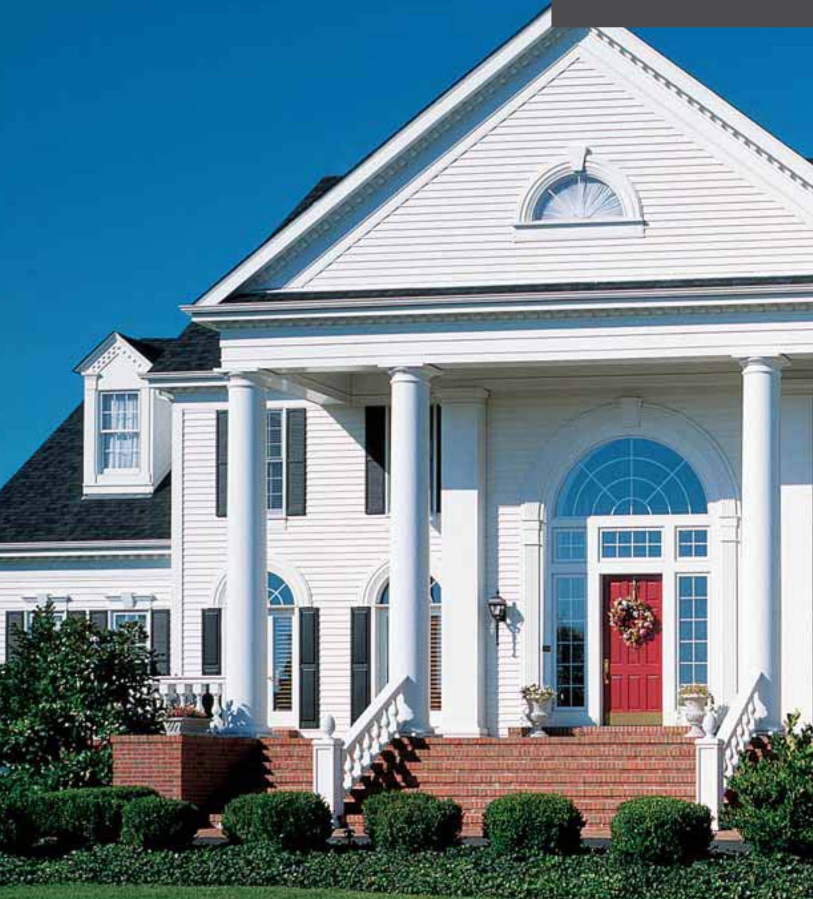
Siding: Millennium double 4" in colonial white. Trim: Beaded SuperCorners in colonial white with colonial white inserts.