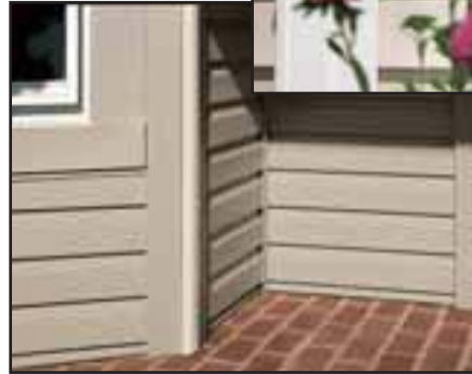
Double 4-1/2" select cedar dutchlap in natural clay with Beaded SuperCorner in natural clay with desert tan insert